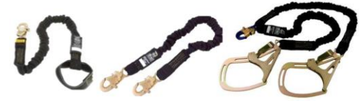
Figure 1. Recalled Lanyards

What You Should Know: 3M Fall Protection is issuing a Stop Use/Recall notice for select 3M DBI-SALA® ShockWave™ 2 Arc Flash shock absorbing lanyards (Figure 1). During an internal review, 3M Fall Protection identified a potential manufacturing issue with a limited number of devices (Table 1). This manufacturing issue could result in the lanyard not performing properly in the event of a fall, which could result in severe injury or death.